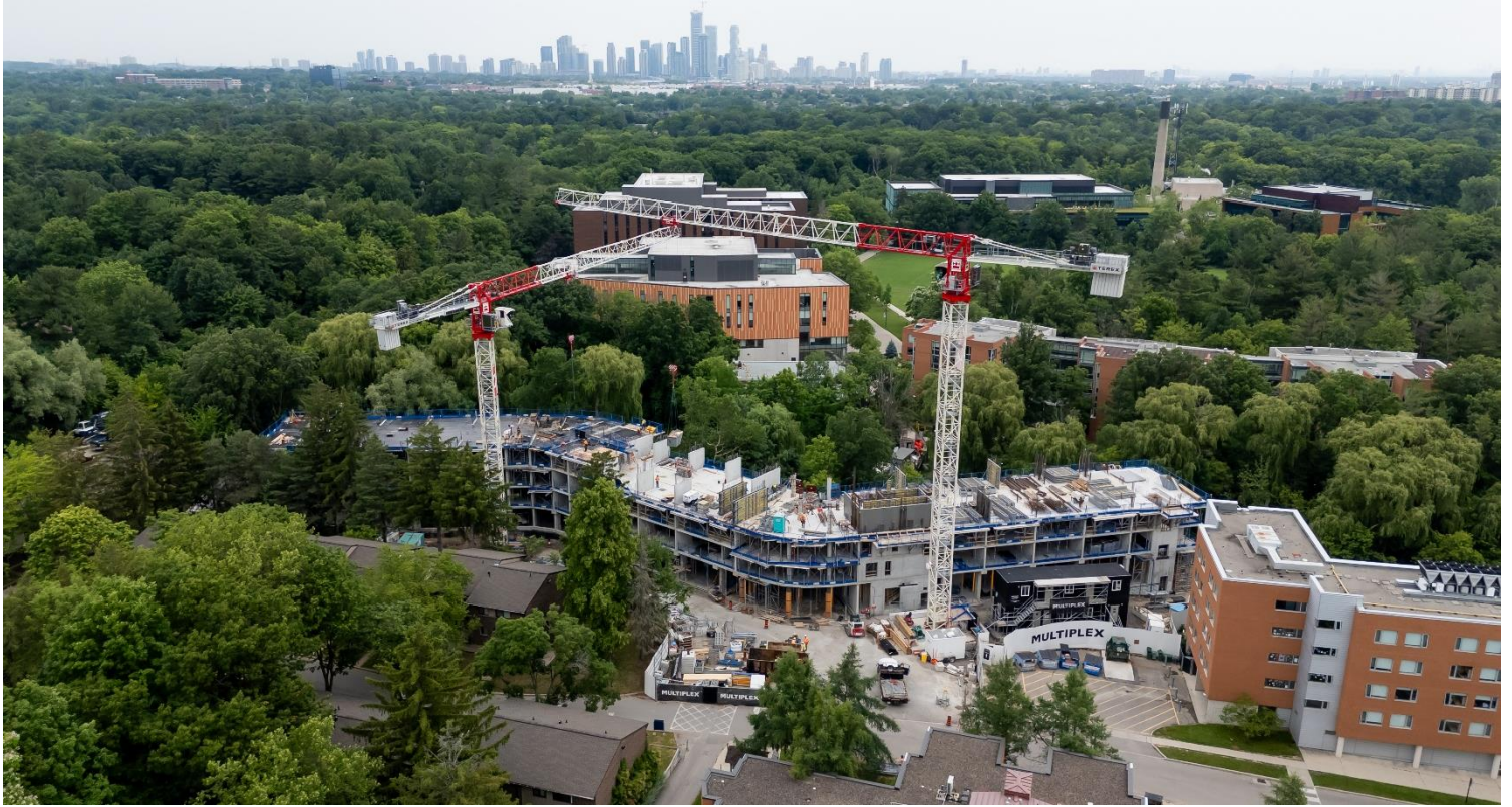
Pictured: Progress update as of July 1, 2025.