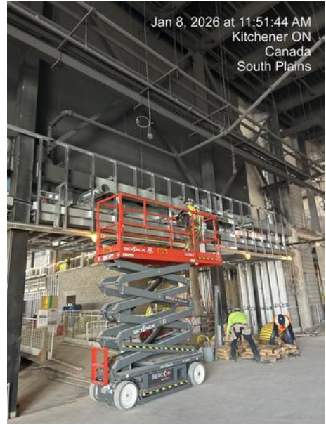
Pictured: Cowan Recreation Centre progress update as of January 9 th , 2026.