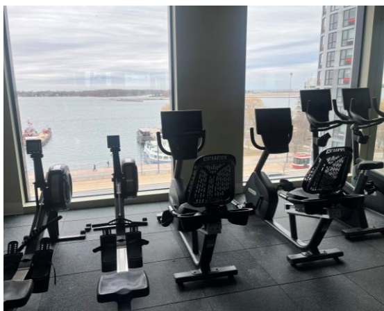
Pictured: Gym equipment at 370.

The community will receive regular project updates and activity- specific notifications throughout construction.