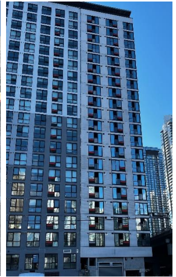
Pictured: Construction of 370 Queens Quay West – October 2024.