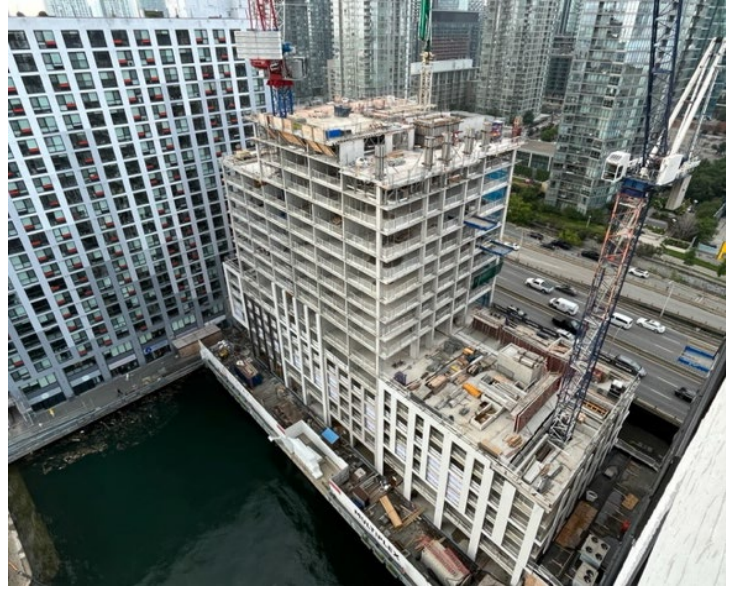
Pictured: Construction of 370 Queens Quay West – June 2023