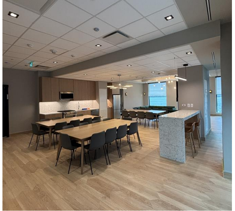
Pictured: Building 370 lobby and party room.