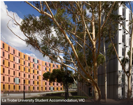
La Trobe University Student Accommodation, VIC