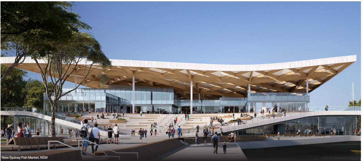
New Sydney Fish Market, NSW