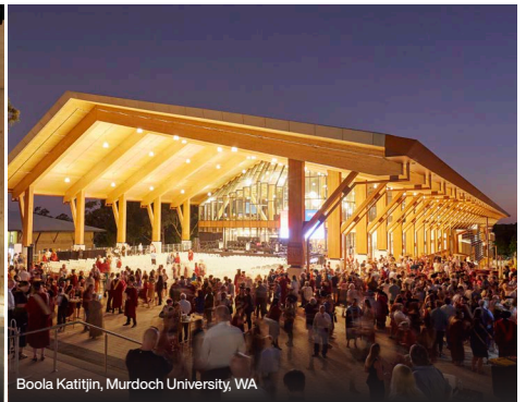
Boala Katitjin, Murdoch University, WA