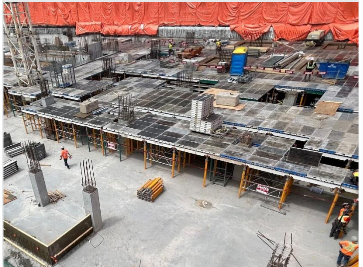
Pictured: The decking for the Basement Level 1 suspended slab.

The New Etobicoke Civic Centre team has officially begun “decking” the Basement Level 1 suspended slab. This is a huge milestone for the project as it is the first concrete slab which will be poured above “grade”. The project has begun to grow vertically.