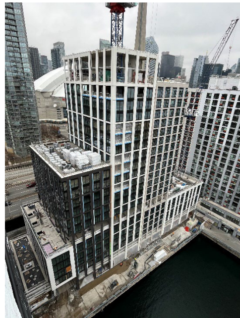
Pictured: Construction of 370 Queens Quay West – December 2023