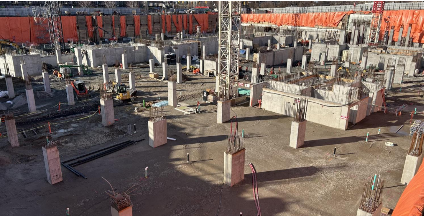
Pictured: Etobicoke Civic Centre progress update as of April 2024.